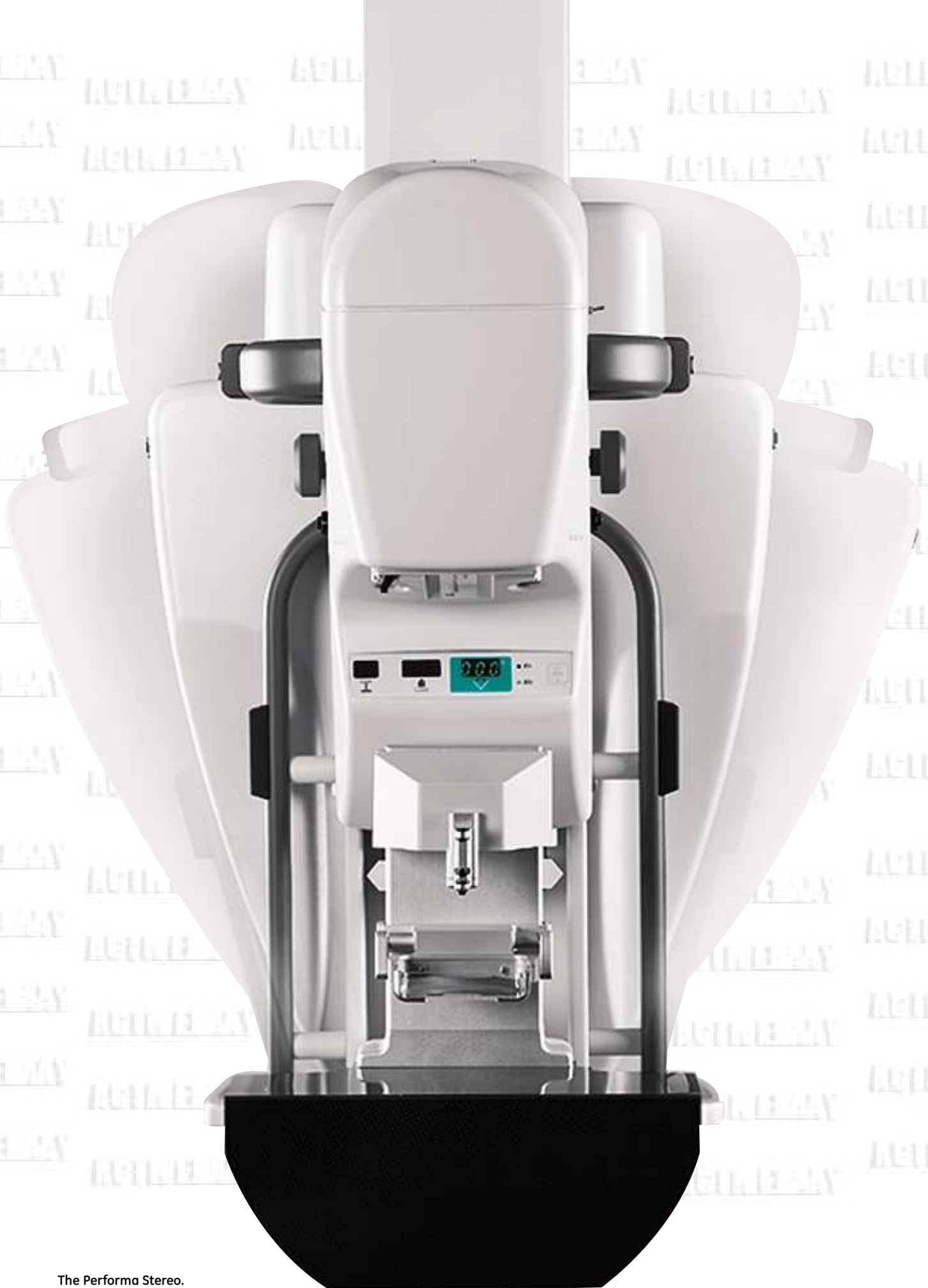
The Performa Stereo.