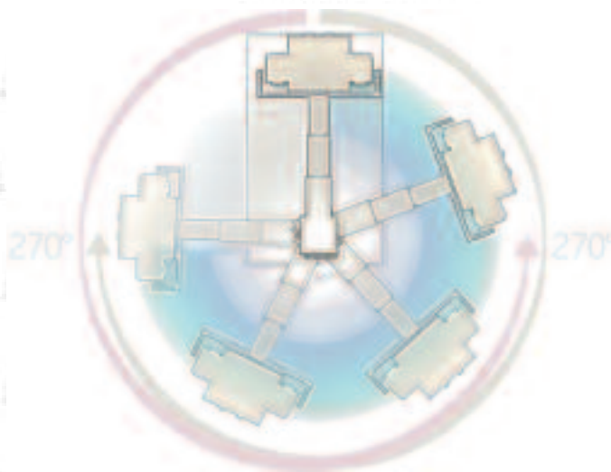
A full range of column motion allows for easy tube positioning.