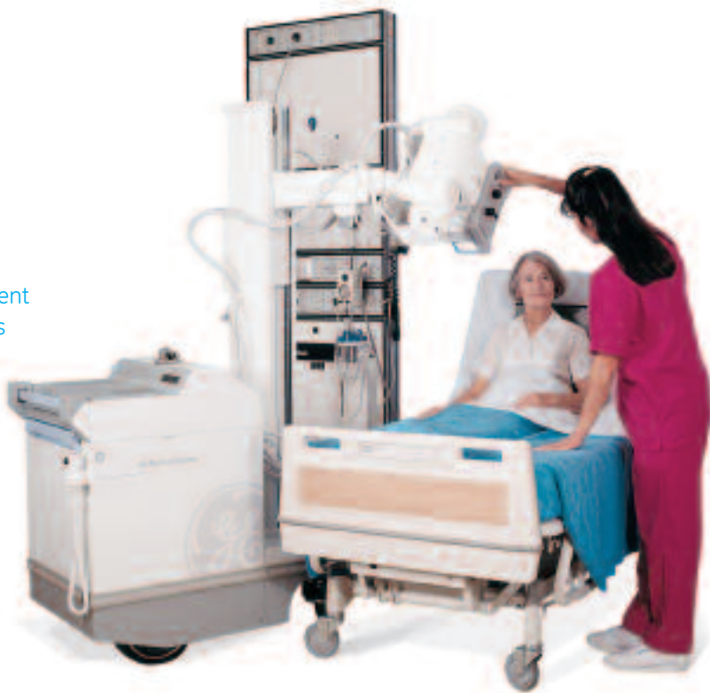
Fast set-up makes the AMX-4+ ideal for virtually any application.