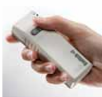
A remote control switch is available as an option.

The Definium AMX 700. One small system. One giant leap for mobile X-ray.