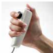
The hand-held switch includes a collimator light to verify image region of interest.