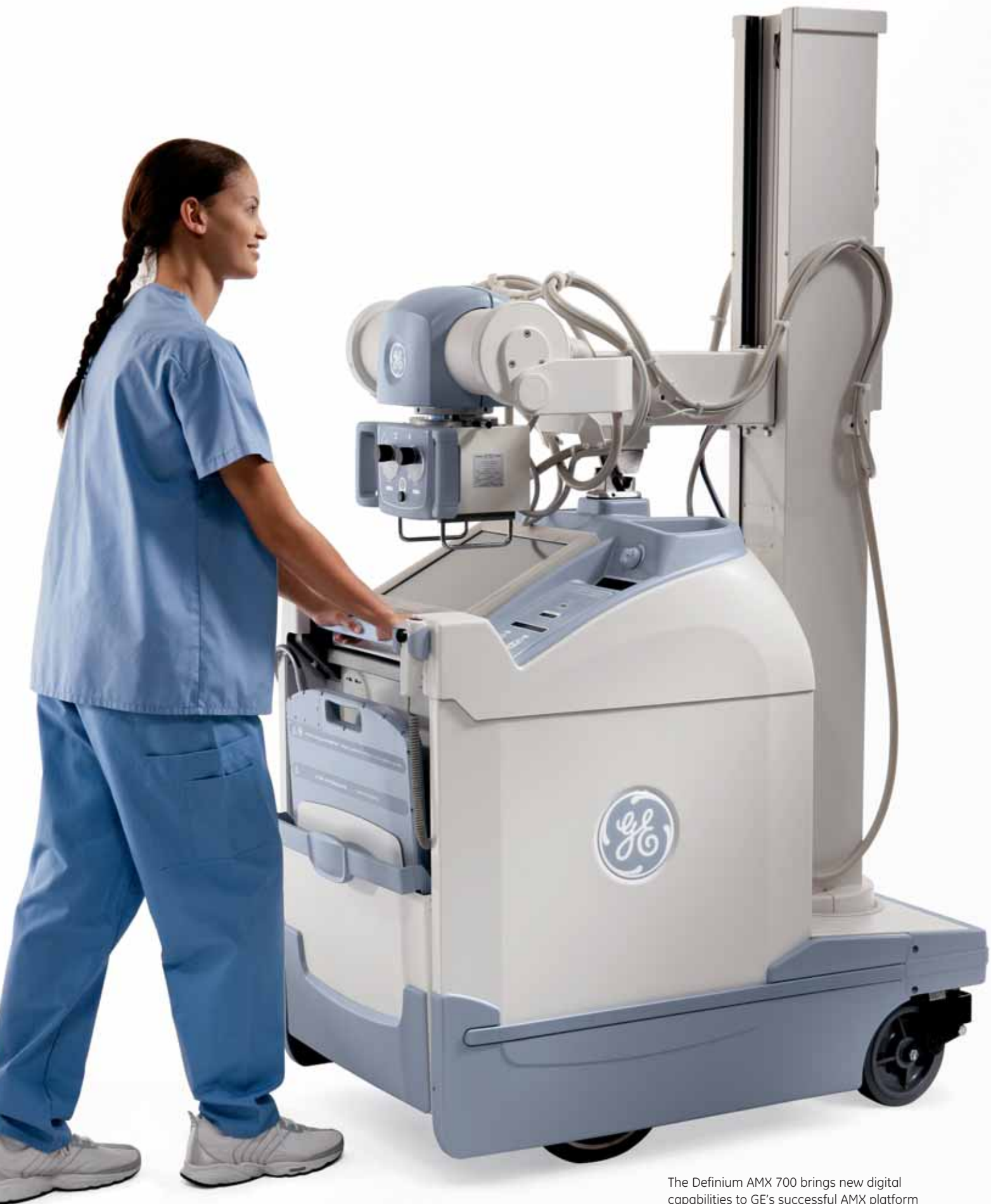
The Definium AMX 700 brings new digital capabilities to GE's successful AMX platform with no compromise in reliability or ease of use.