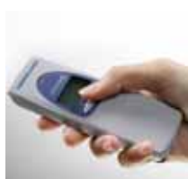
An optional barcode scanner is available for quick and easy access to patient information.