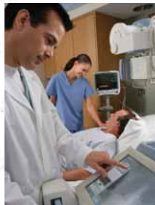
High-quality images are available at the bedside within seconds for technologist or physician review.

And the hassle and expense of managing film or cassettes? They're left by the wayside.