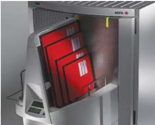
Integrated CR user station for time-saving identification and optimized workflow