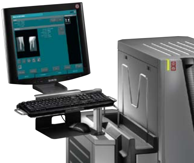
Integrated CR User Station for time-saving identification and optimized workflow.

An economical way to go digital CR is compatible with all existing X-ray systems, allowing X-ray departments to go digital without significant additional investments and workflow adaptations.