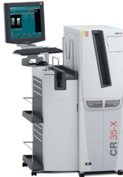
CR 35-X can easily be placed at any location, even in combination with the CR User Station.