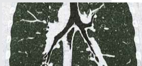
Chest (bronchus) multiplanar reconstruction (MPR) image