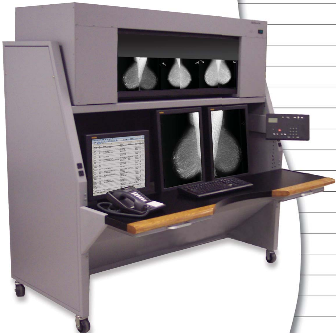
Mammography Digital Viewing Station (MDVS), consists of the MS-400DVS as shown on top of the DVS-2-MS.