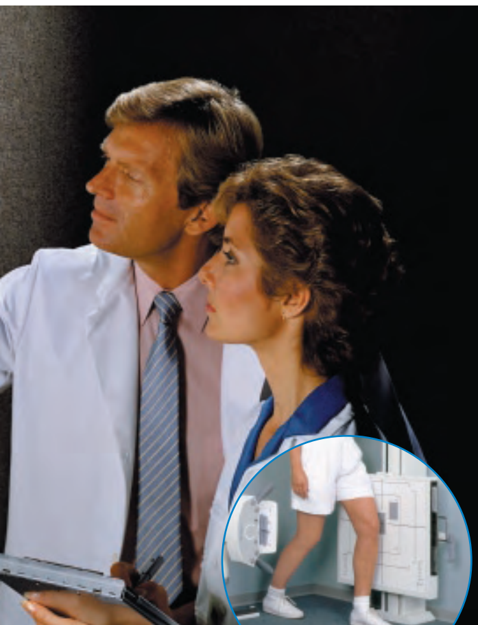
Weightbearing Studies with central x-ray beam only 13.75" above floor